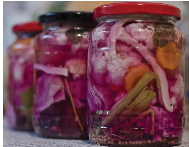
Figure 1 - Home-made and home-stored canned food (pickles).

Disclosure. Authors have no conflict of interests, and the work was not supported or funded by any drug company.