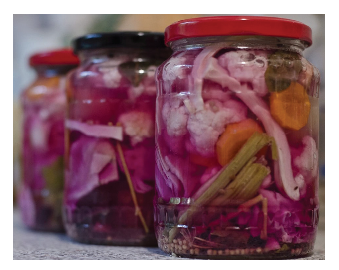
Figure 1 - Home-made and home-stored canned food (pickles).

Disclosure. Authors have no conflict of interests, and the work was not supported or funded by any drug company.