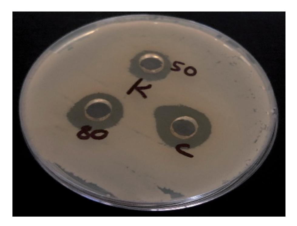
Figure 1 - Zones of inhibited bacterial growth due to the presence of Manuka honey in different concentrations 50%, 80% and C (concentrated - 100%).

Well diffusion assay. Manuka honey UMF +15 remarkably inhibited the growth of Carbapenem-