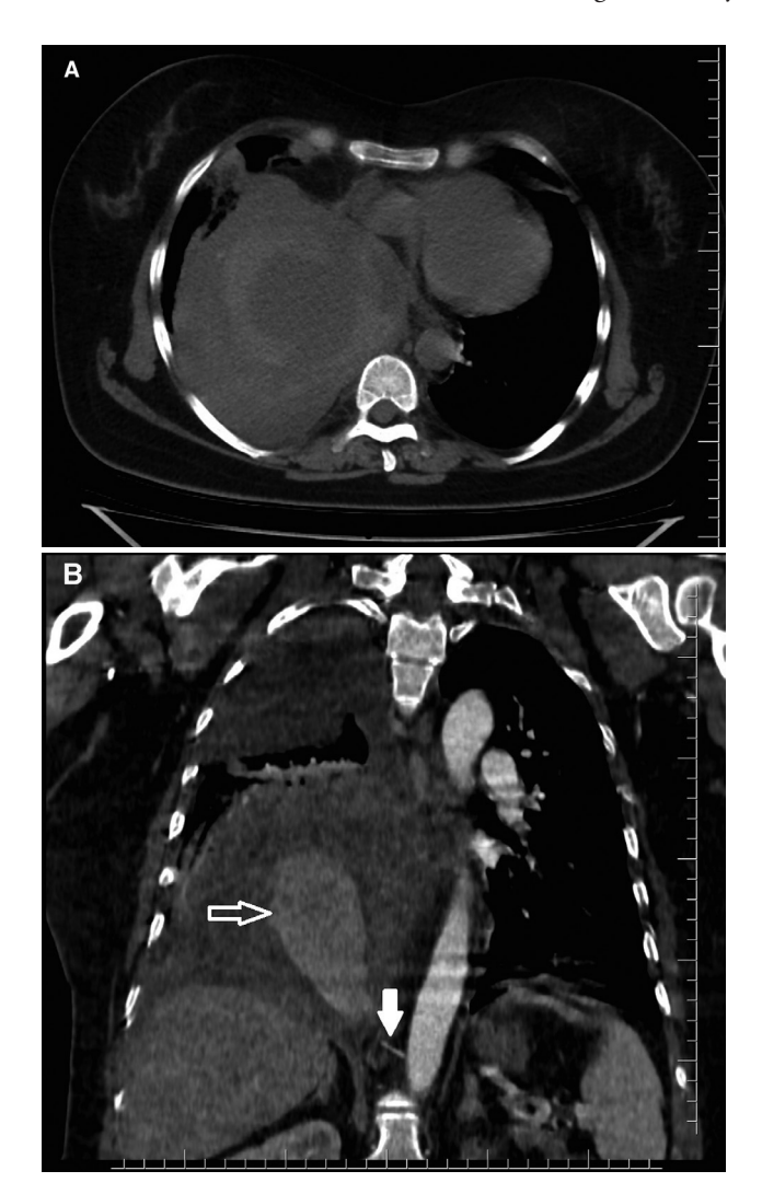
Figure 1 - Non-contrast CT axial slice demonstrates a large hypodense lesion with a smooth contour in the lower region of the right lung and a ring of hyperdense thrombus peripherally A) Non-contrast computed tomography (CT) axial slice showing a large hypodense lesion with a smooth contour in the lower region of the right lung and a ring of hyperdense thrombus in the periphery of the lesion. B) Contrast-enhanced CT section of the coronal plane showing an aberrant left gastric artery (filled white arrow) arising from the right lateral wall of the aorta and a giant aneurysm (hollow white arrow) in the right inferior lung.

at the level of the fifth intercostal space, using VATs. On exploration, a mass approximately 13 cm in size invading the diaphragm was found in the right lung. The branch of the left gastric artery supplying the aneurysm in the right lower lobe was identified and ligated. Partial diaphragmatic resection with right lower lobectomy was carried out. Diaphragm was closed with polypropylene sutures (Figure 2).