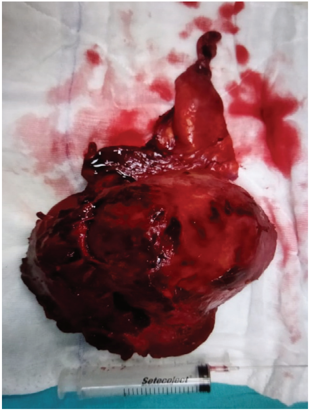
Figure 2 - Macroscopic specimen of a giant aneurysmal sac completely removed from the right hemithorax using the video-assisted thoracoscopic surgery.

at the level of the fifth intercostal space, using VATs. On exploration, a mass approximately 13 cm in size invading the diaphragm was found in the right lung. The branch of the left gastric artery supplying the aneurysm in the right lower lobe was identified and ligated. Partial diaphragmatic resection with right lower lobectomy was carried out. Diaphragm was closed with polypropylene sutures (Figure 2).